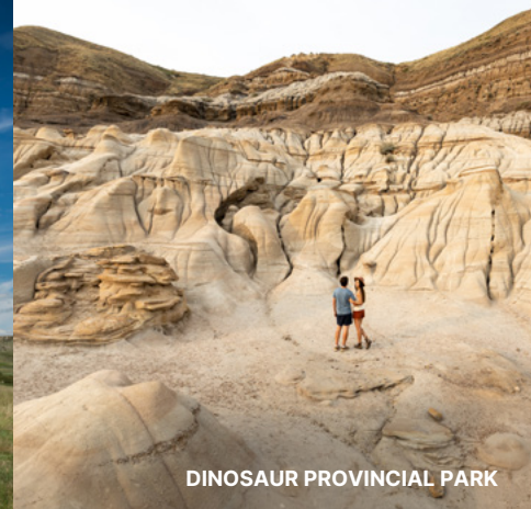
DINOSAUR PROVINCIAL PARK