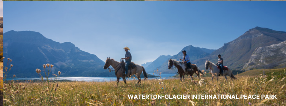
WATERTON-GLACIER INTERNATIONAL PEACE PARK