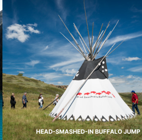
HEAD-SMASHED-IN BUFFALO JUMP