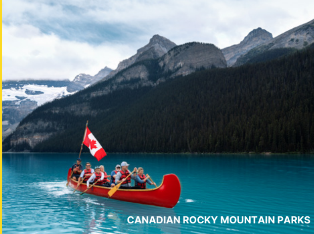
CANADIAN ROCKY MOUNTAIN PARKS

Explore the Canadian Rocky Mountain Parks including Banff and Jasper to the west, Waterton-Glacier International Peace Park, Head-Smashed-In Buffalo Jump, and Writing-on-Stone Provincial Park to the south, plus Dinosaur Provincial Park to the east—making Calgary the perfect base for extraordinary heritage experiences.