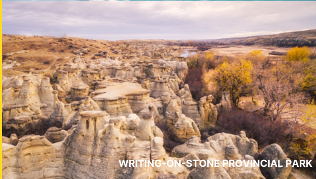
WRITING-ON-STONE PROVINCIAL PARK